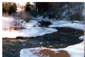
Winter Stock Runs

If a stock run is delayed or cancelled due to inclement weather, (see www.tumalo.org for why) we may have to reschedule a run with little or no notice.